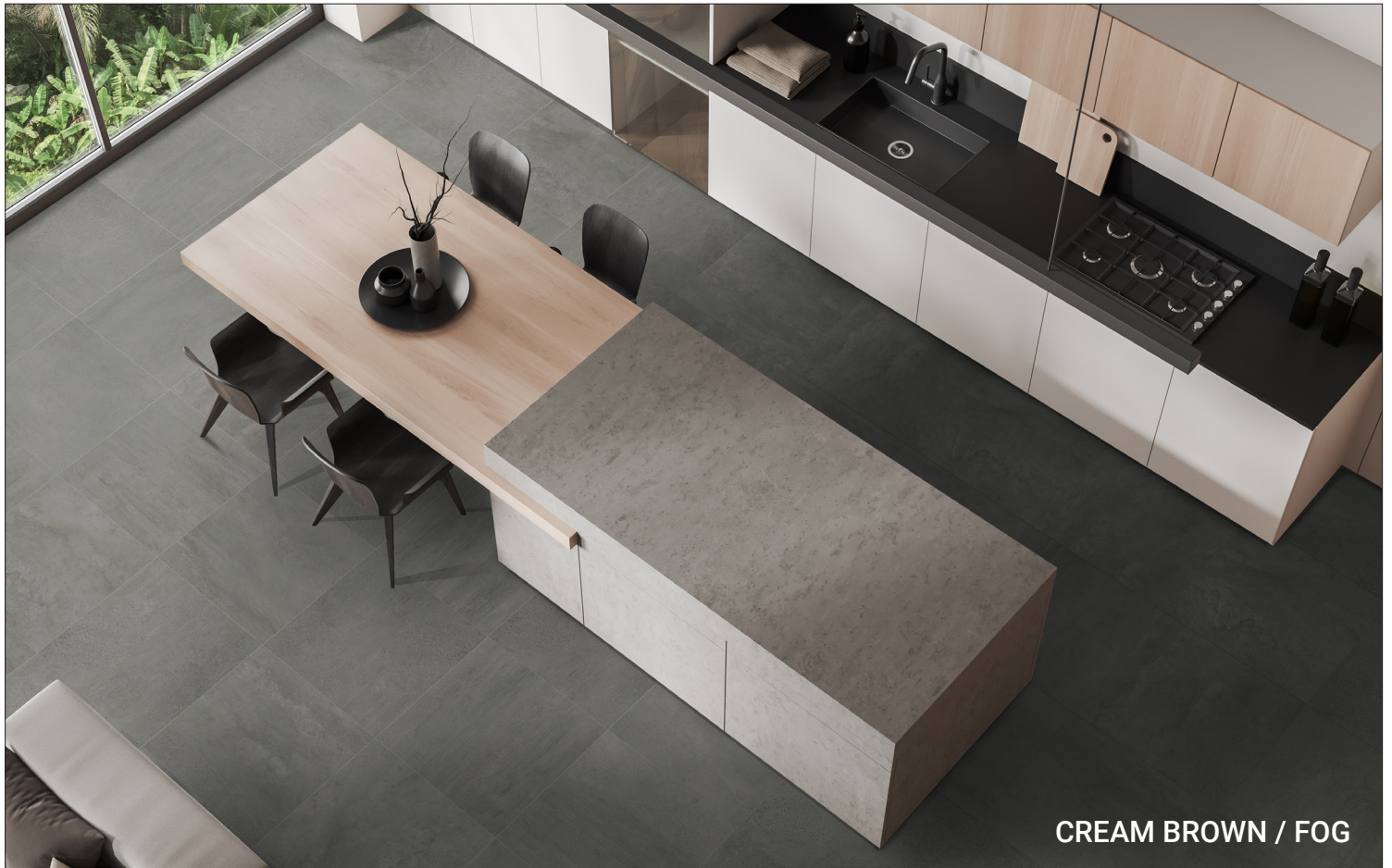
CREAM BROWN / FOG