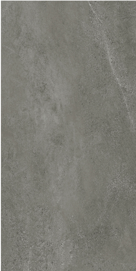
30 x 60 cm (12" x 24") Matte Finish HV.CS.SMK.1224.MT

All items shown in this document are part of Olympia's stocking program. For special orders, please contact your Olympia Tile Sales Representative.