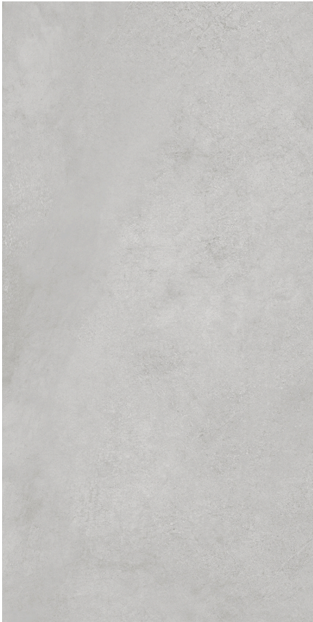
30 x 60 cm (12" x 24") Matte Finish HV.CS.OWT.1224.MT